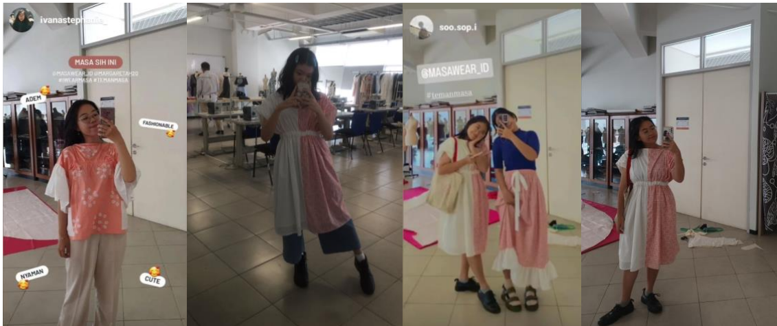
Figure 1. Designer's Interaction and Feedback Documented by Peers Independently

The P2P interaction also served as validation towards the prototype produced at an earlier stage, so that adjustments were possible to be made. For example, the neckline cut for the dress was a little bit high therefore at the second stage of prototype making, adjustment was made to lower the neckline. The prototype set was made available for a month in the studio to allow peers independently review, give feedback, and give them a try. This allows the designer to understand that loose cut and multi fabric used in this first collection have made a positioning and initial branding to Masa apart from the zero waste patterns it uses. These additional values will help in reaching a wider audience even those who may not engage in ecological issues.