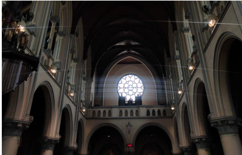
Picture 1. Rose-shaped glass