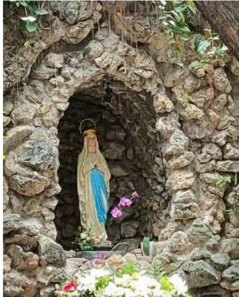
Picture 5. Statue The Virgin Mary