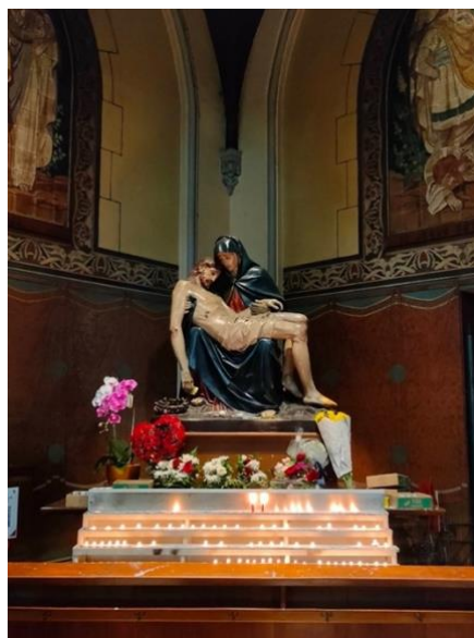
Picture 6. Virgin Mary receiving her lifeless son