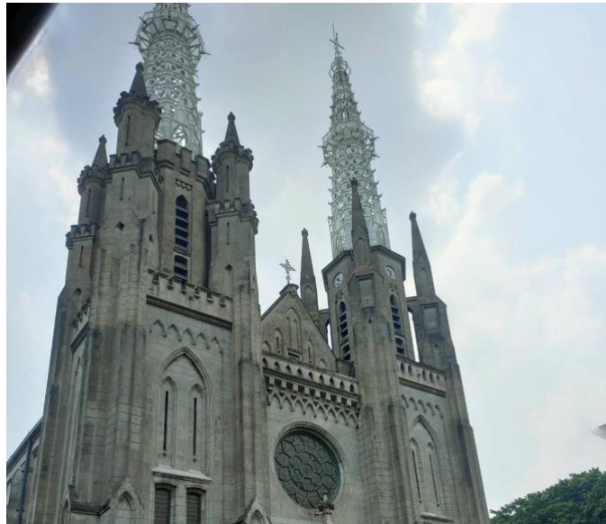
Picture 2. Tower of David's fortress and Ivory Tower