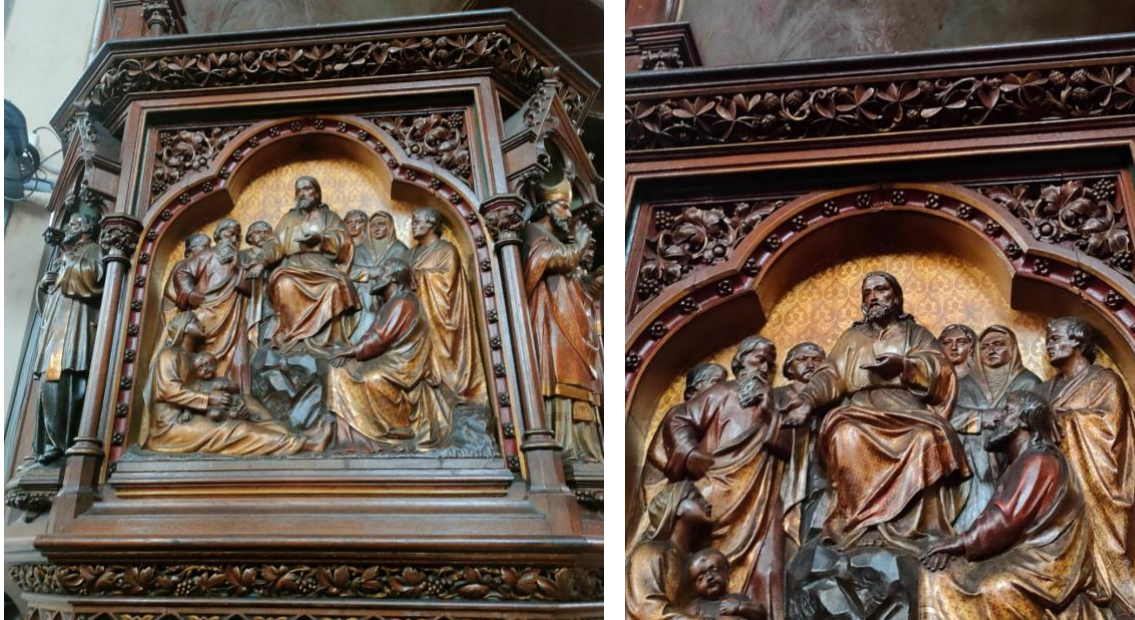
Picture 3. Carving of the Lord Jesus preaching on the hill